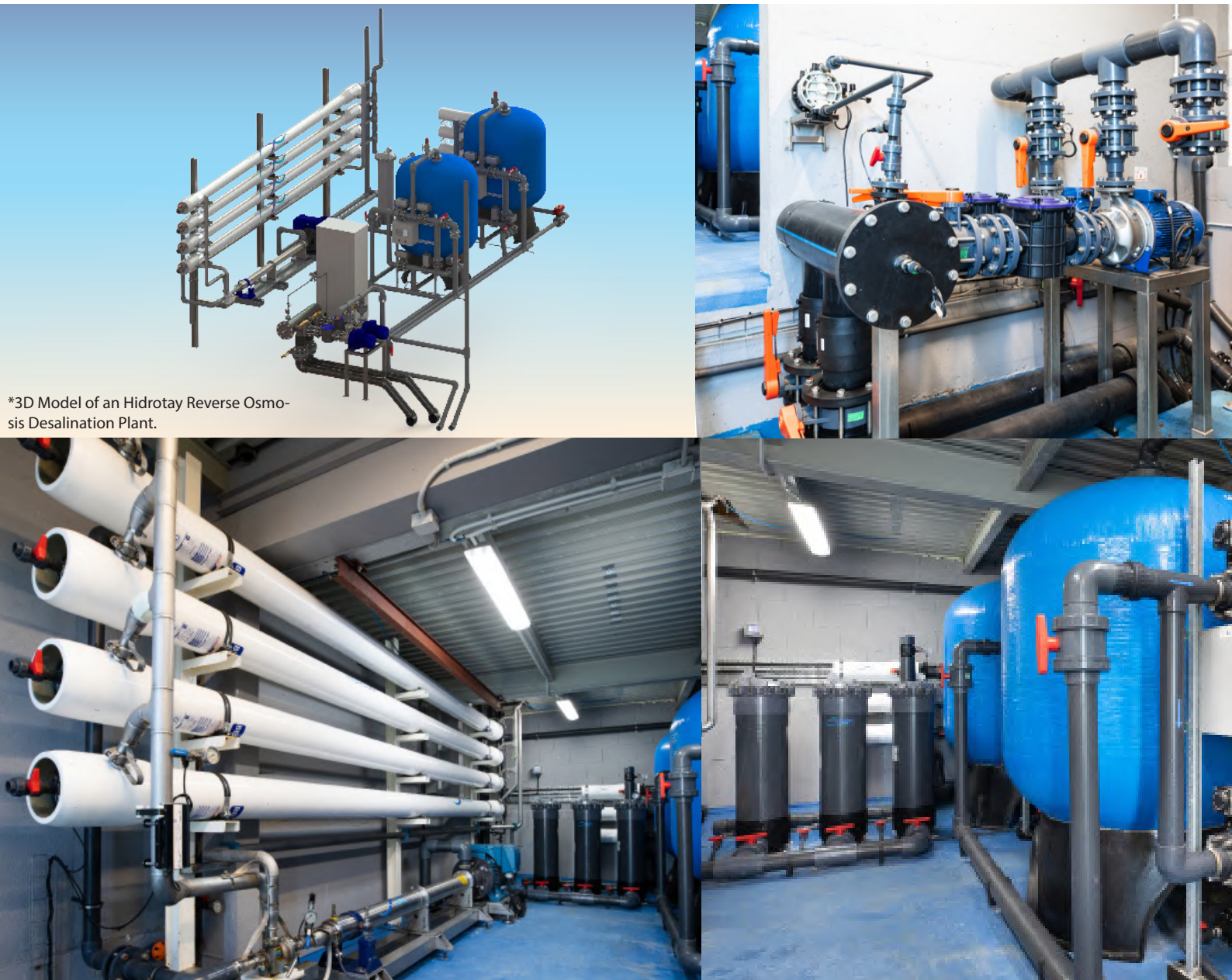
*3D Model of an Hidrotay Reverse Osmosis Desalination Plant.

Much of the industrial activities require high flows of purified water, from the boilers of power plants to the processing of any type of food. The water to be used must also meet a series of strict physical-chemical requirements that must be achieved with specific combined treatments. Once the production requirements are known and the nature of the supply water is studied, we proceed with the design of the installation using software. Thus we have at any time a clear visualization of what we are doing, thus improving communication with the client.